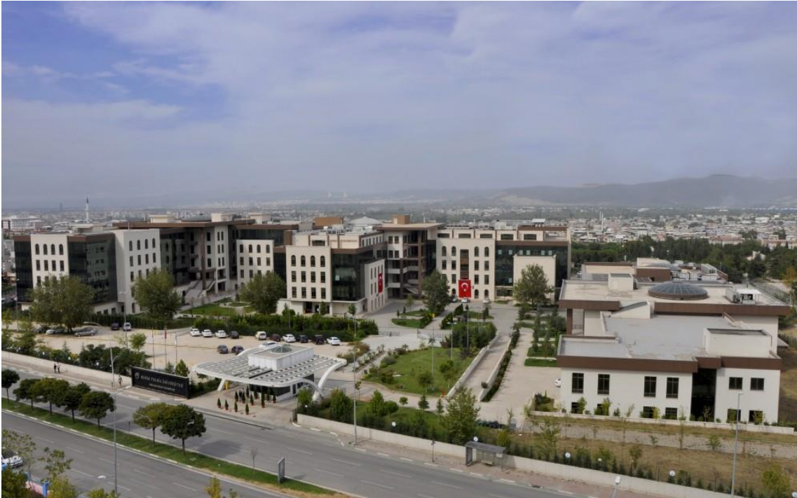
Mimar Sinan Campus

Bursa Technical University spreads over two campuses, Mimar Sinan Campus and Yıldırım Campus, with a total of 99.480 m 2 of outdoor areas and 83.915 m 2 indoor areas.